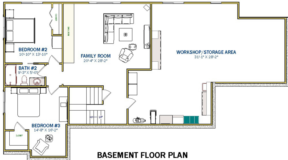
BASEMENT FLOOR PLAN 937 SQ FT FINISHED

Dusendang Custom Homes www.davedusendanghomes.com 616.874.7085