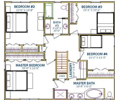
2ND FLOOR PLAN 1152 SQ. FT.